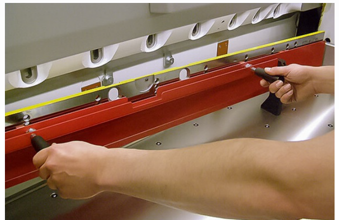
Blade changes are safe, quick and easy. This image shows the blade mounted in the protective guard after it was lowered by the knife hoist.

Low pressure device (for corrugated and pressure sensitive material)