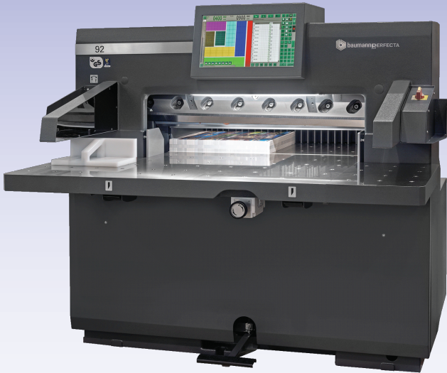
* Image shows machine with smaller air side tables

36" Wide Format Powerful Gearbox-Driven Knife Hydraulic Clamping 18.5" Color Touchscreen Controls Stainless Steel Tables Simple And Safe Blade Changes