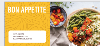
#10 Envelope $.032 per copy / $32.60 per 1,000*