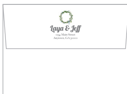
A7 Envelope $.0004 per copy / $.40 per 1,000*