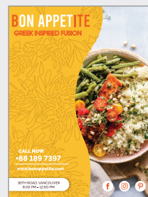
8.5" x 11" $.075 per copy / $75.40 per 1,000*