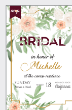
4" x 6" Postcard $.0039 per copy / $3.99 per 1,000*