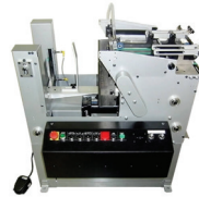
KR502N – Napkin Feeder

An affordable industrial feeder designed to feed flat, die-cut boxes and other difficult products.