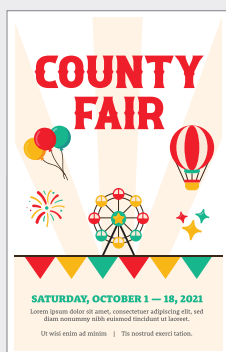
11" x 17" $.042 per copy / $42.30 per 1,000*