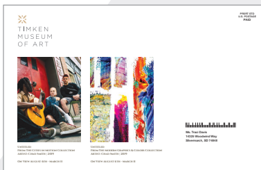
9 x 12 Envelope $.0169 per copy / $16.90 per 1,000*