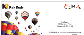
#10 Envelope $.008 per copy / $8.11 per 1,000*