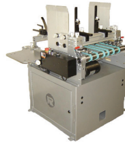
KR500 – Friction Feeder

With 3 feed modes and compatible with product up to 18" wide, this is one of our most dependable friction feeders.