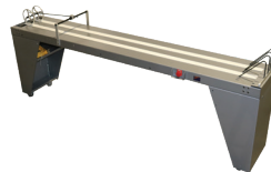
KR314 – Shingle Conveyor

Available in 4, 6, 8, 10, and 12 foot lengths.