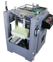
KR503 – Friction Pile Feeder

Offers a consistent feed for difficult products with fully adjustable guides.