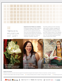
8.5" x 11" $.028 per copy / $28.50 per 1,000*