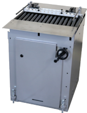
KR840R – Roller Registration

Accurately register a wide range of product, with right or left justification options.