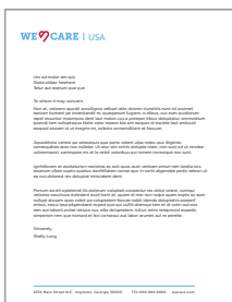
8.5" x 11" $.003 per copy / $3.05 per 1,000*