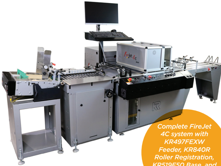
Complete FireJet 4C system with KR497FEXW Feeder, KR840R Roller Registration, KR519F50 Base, and KR314-4 Shingling Conveyor.