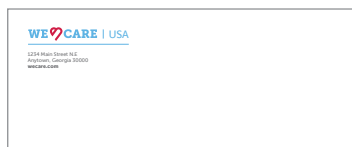
#10 Envelope $.0013 per copy / $1.30 per 1,000*

The FireJet 4C is a cost-effective system for printing a wide variety of products such as envelopes, postcards, flyers, and posters.