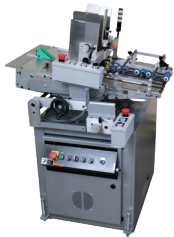
KR497BW – Servo Friction Feeder

This is a larger version of our popular friction feeder. It can handle a large variety of products from envelopes to posters.