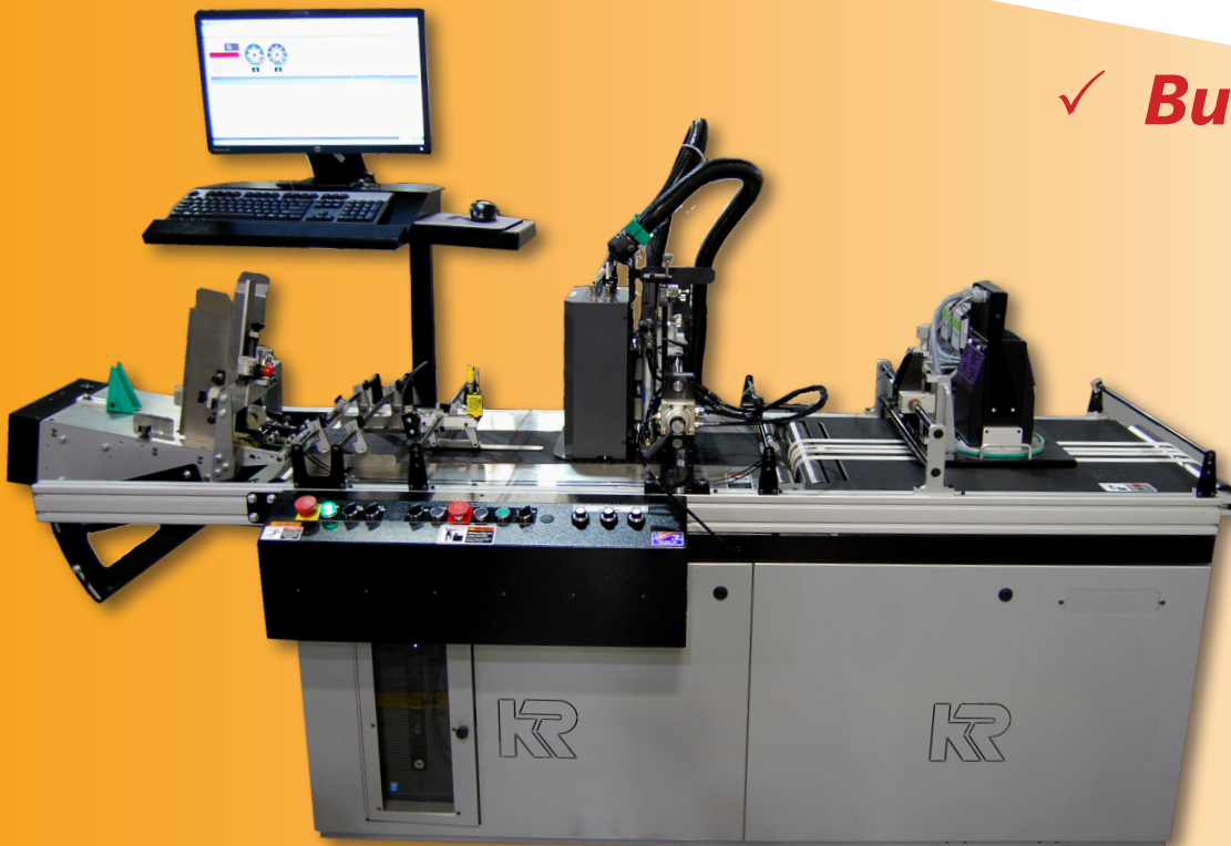
UV Phoenix HS with LED curing